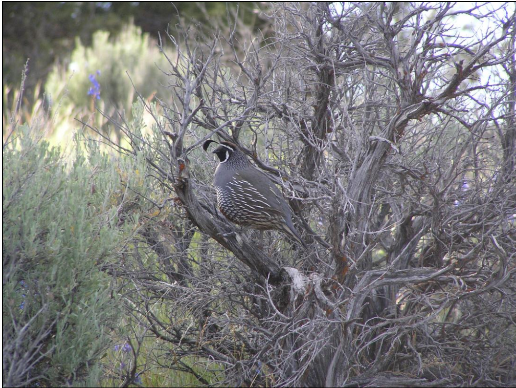
Quail in Camouflage ( Callipepla californica).

Note: This list is a combination of wildlife sight record data from Memorial Day Weekend, May 2011, Ruby Valley.