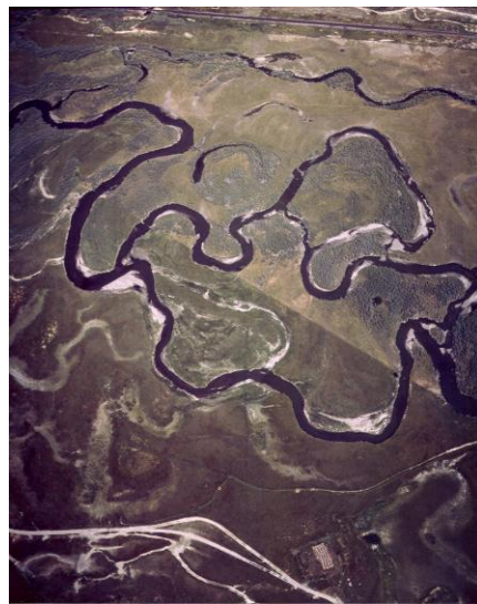
Figure 1. Boyd Humboldt Valley Wetlands National Important Bird Area (IBA) from 3,000 feet on 28 July 1983.

Word came from Jim Elias, Chief Operating Officer with American Lands Conservancy (ALC) that as of 10:46 a.m., 28 June 2011, the Boyd Humboldt Valley Wetland National Important Bird Area and surrounding uplands of the Boyd Family Ranch is now protected in perpetuity by a Conservation Easement, the first of its kind for ranches along the main stem of the Humboldt River in northern Nevada. In short, the ecosystem within the boundaries of the Boyd Ranch, including flooded wetlands, native hay meadows, river riparian and sagebrush steppe uplands are protected for all time from wildlife habitat destruction and landscape subdivision (Figures 1-5).