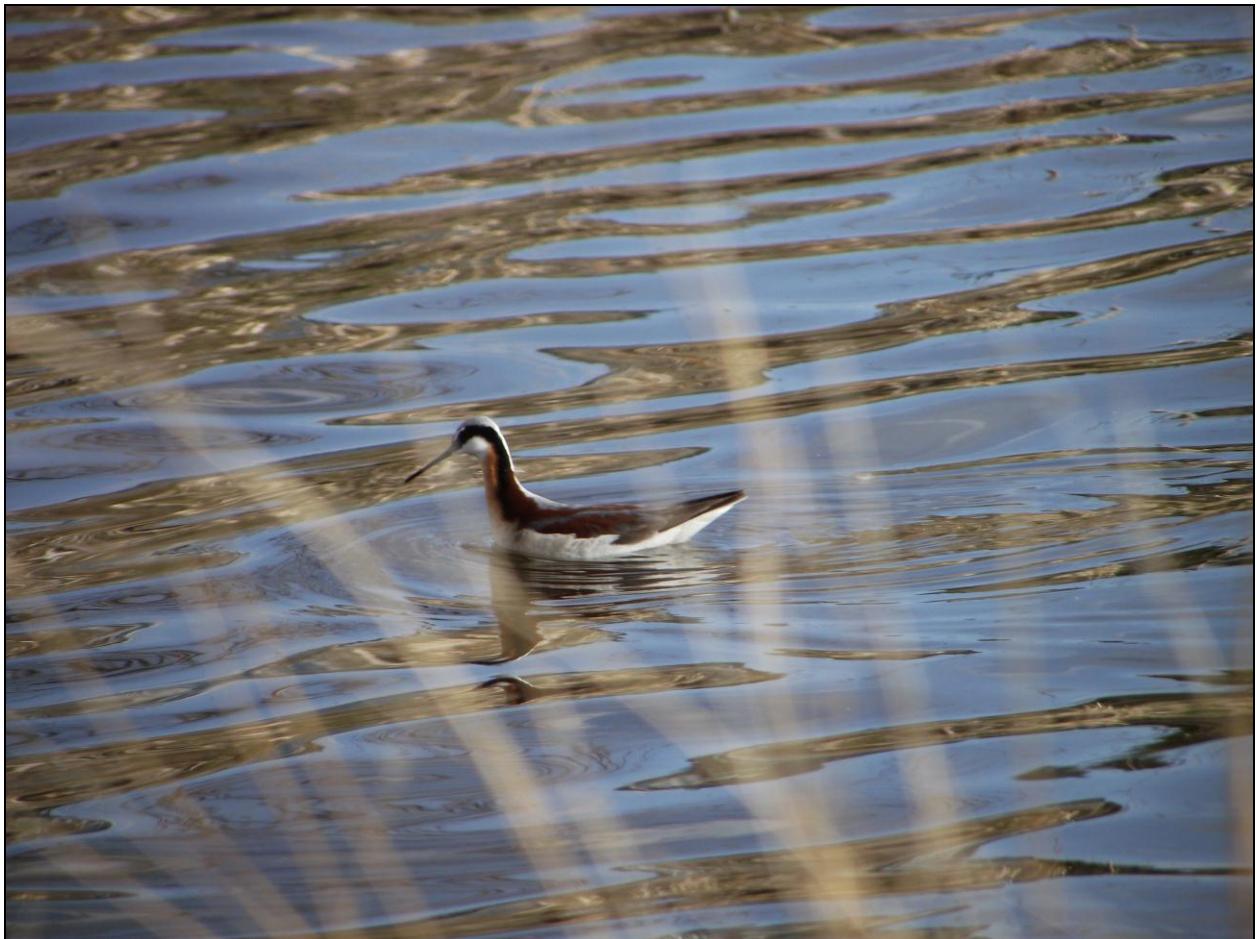
Figure 3. Female Wilson's phalarope ( Phalaropus tricolor ) swimming in pond of silver and gold, 9 May 2011. Nesting species in Boyd Humboldt Valley Wetland.

Because of over 140 years of perseverance, Boyd Ranch properties provide a window into potential wildlife productivity of much of the upper Humboldt River System, in particular those properties heretofore not so well tended. And, because of their vision for the future, the Boyds provide us hope for the long term preservation, restoration and conservation of the entire system as a ribbon of wildlife habitat through one of the driest cold deserts in North America. If all goes well, the Boyd Humboldt Valley Wetland will be only the first in a long string of Conservation Easements that will protect the Humboldt River System for all time.