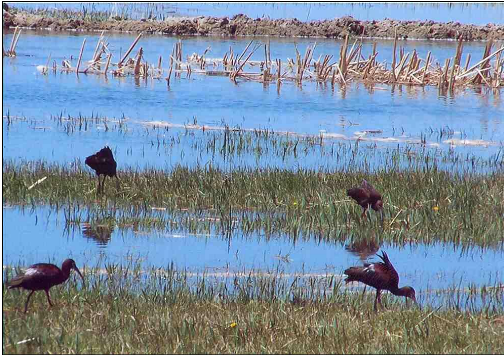
Figure 4. White-faced ibis ( Plegadis chihi ) foraging near nesting colony on Boyd Humboldt Valley Wetland.